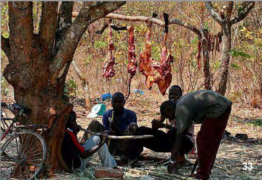
Men selling the meat along the road