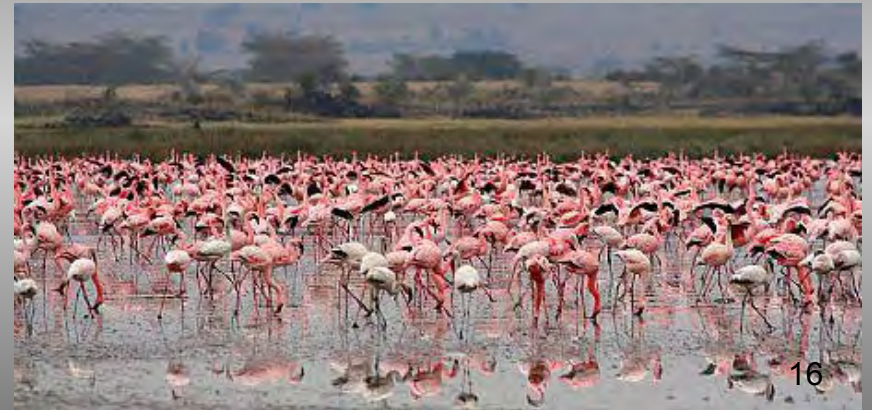
Elementaita lake is full of flamingos