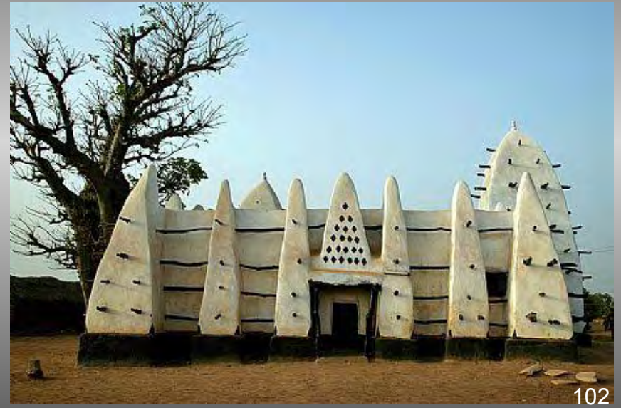
Larabanga, one of the oldest mosques in Africa, supposedly 600 years old.