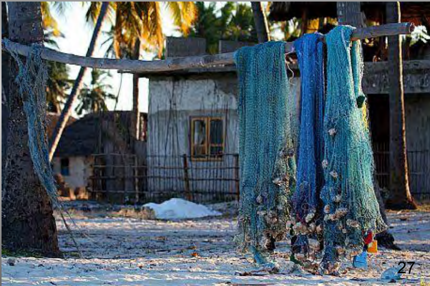
A typical village at Zanzibar, an island beloved by tourist