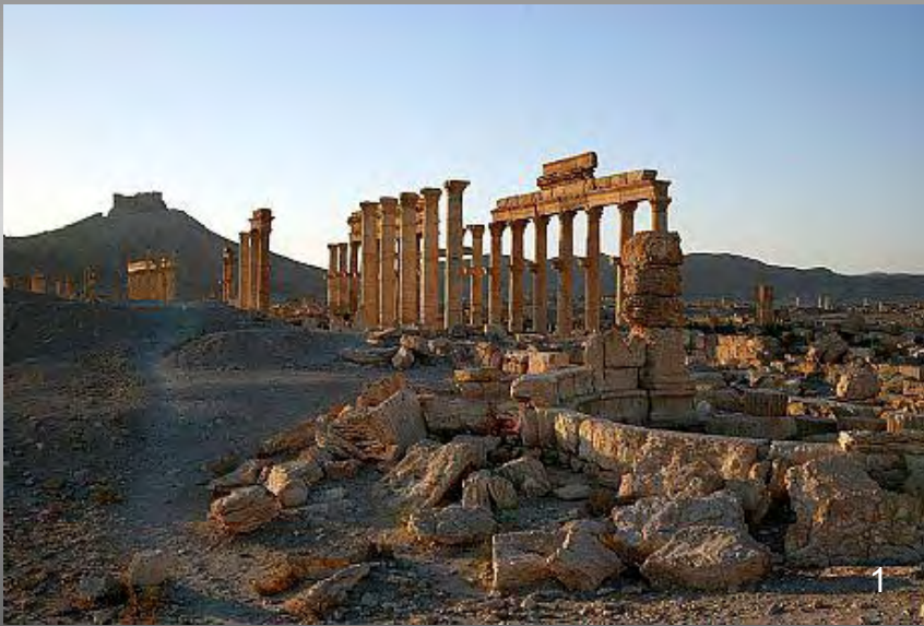
Palmyra, old famous ruins in Syria