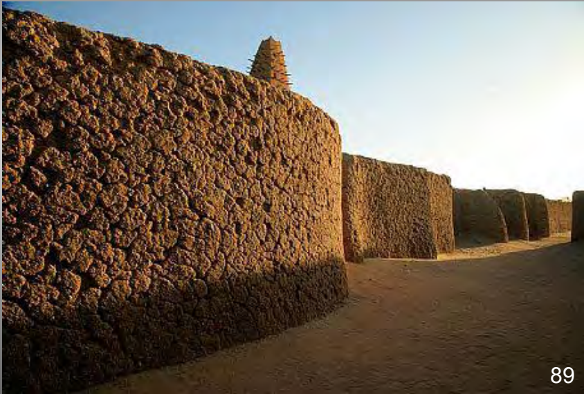
Agadez, a desert town has wonderful atmosphere.