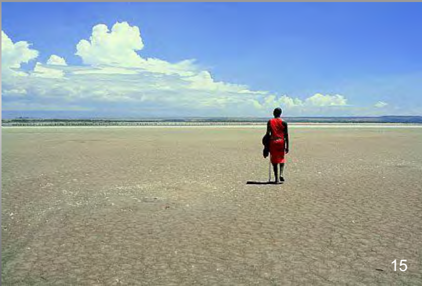
A Maasai man is walking on the ground of a drying out lake