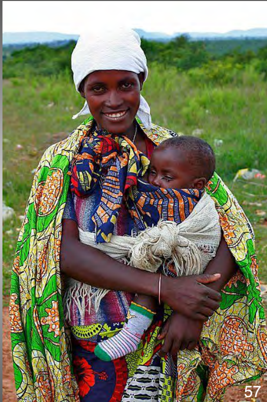
Beautiful unknown black beauty