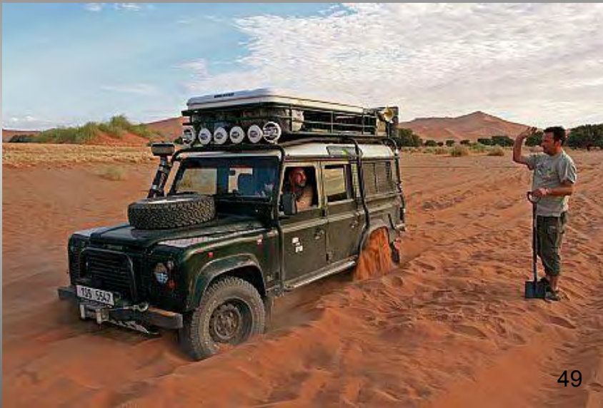
It is easy to get stuck in sand