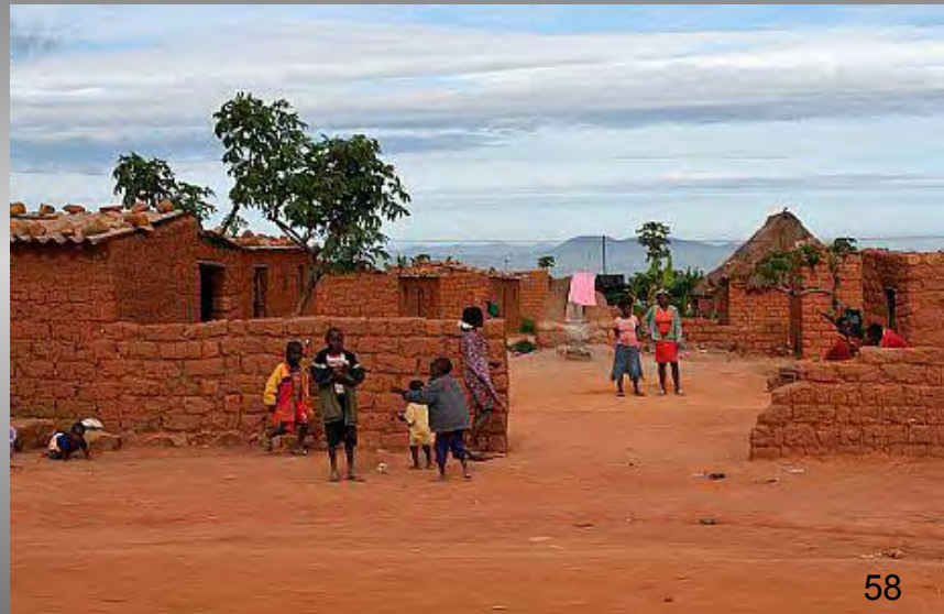
Unlike in cities there is no rubbish in villages.