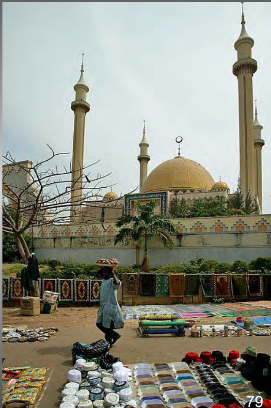
Capital Abuja, a market in front of a mosque. Here one can buy witchcraft