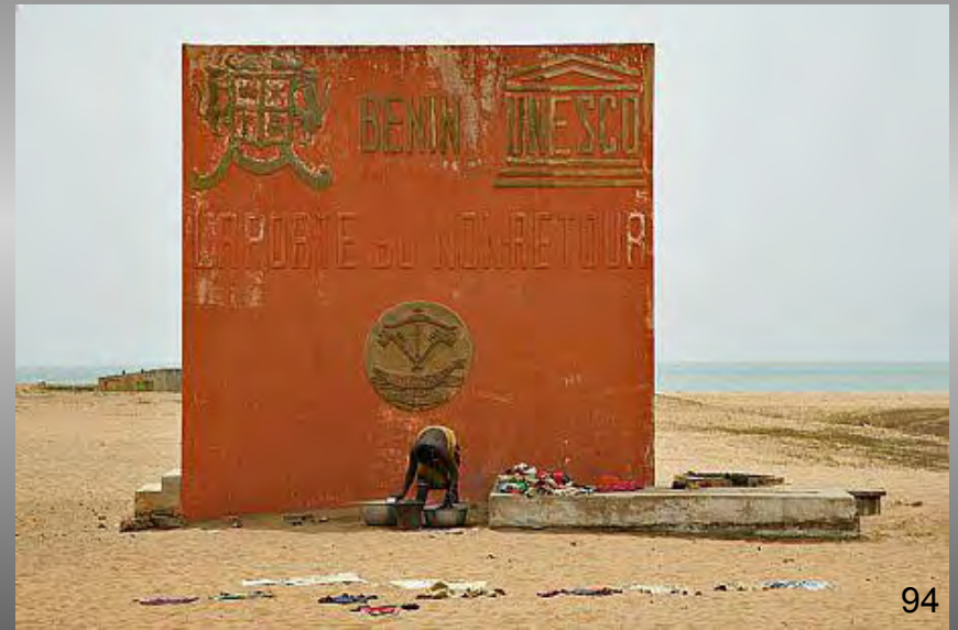
Memorials dedicated to slaves.