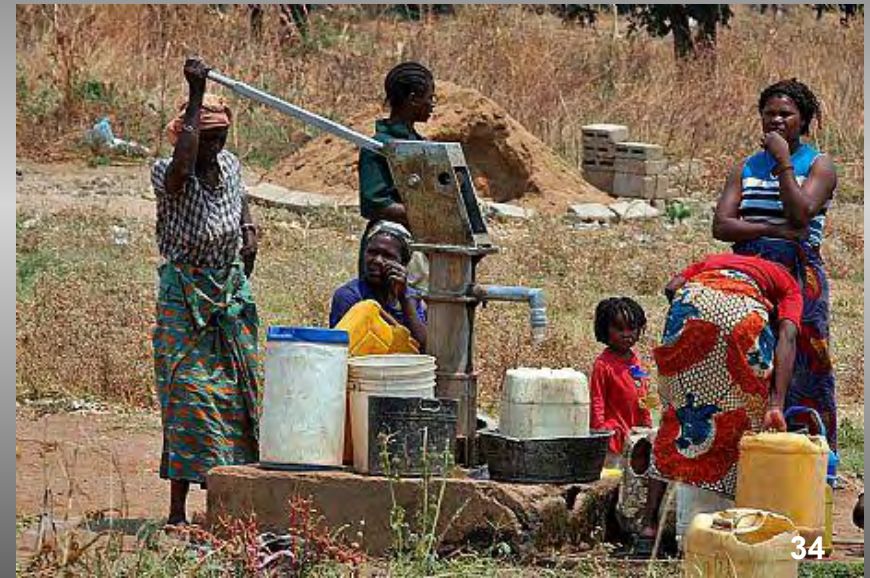
Women usually take care of fetching water