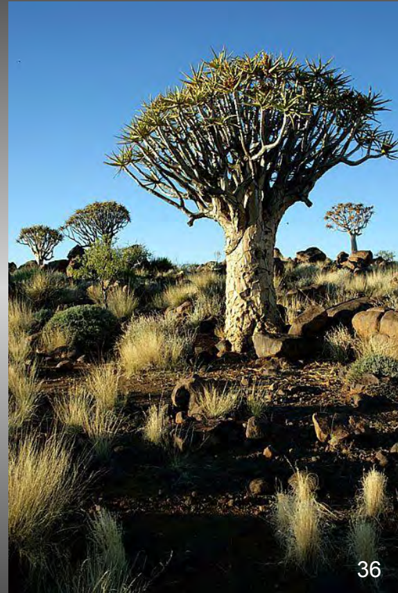
Quiver tree is a fantastic subject for photographers