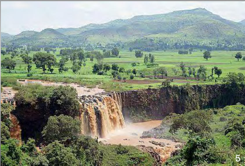
Famous Blue Nile waterfalls