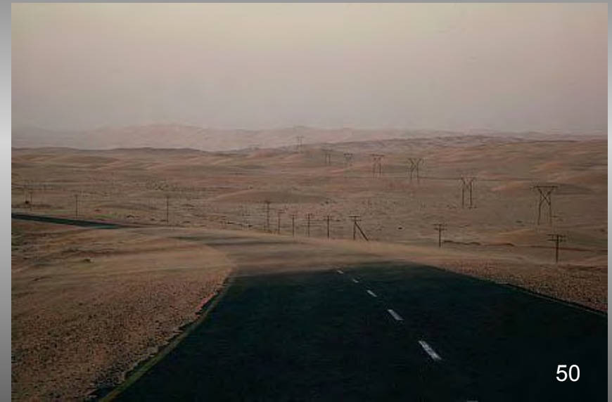
Road to Kolmanskop, a town being swallowed by desert.