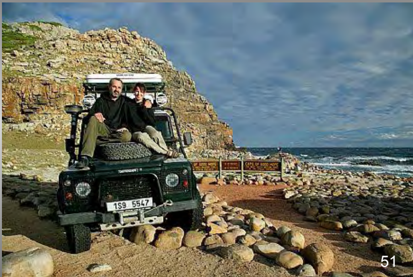
Us two at the famous Cape of Good Hope