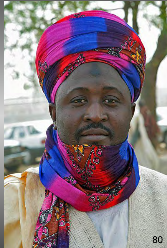
One of the local chiefs waiting for a sultan.