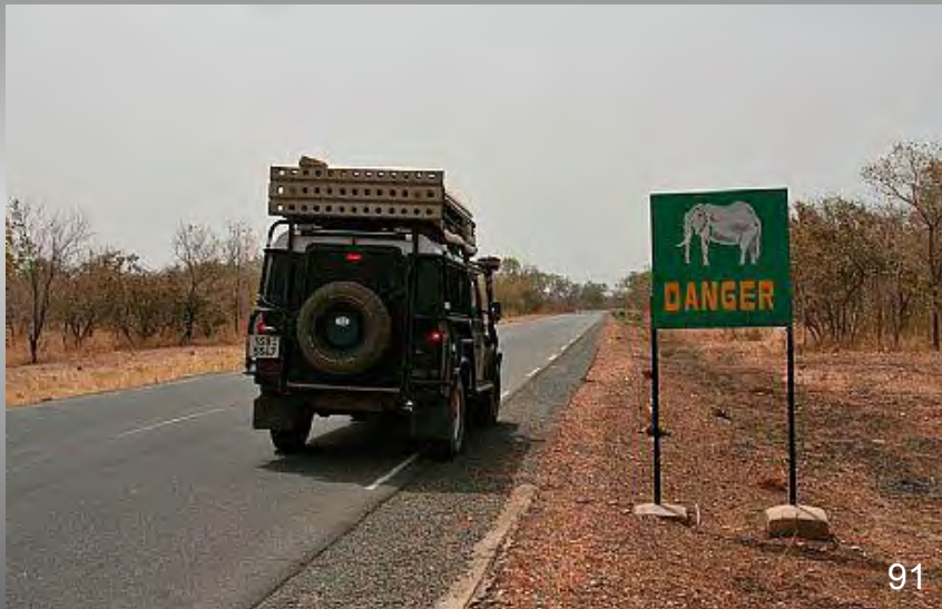
Warning - but no elephants occurred.