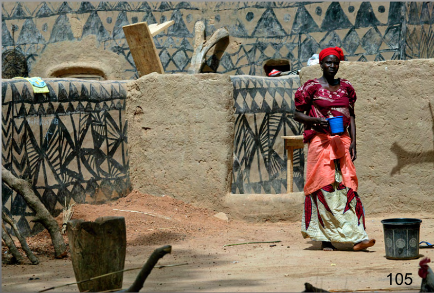
a woman in her house