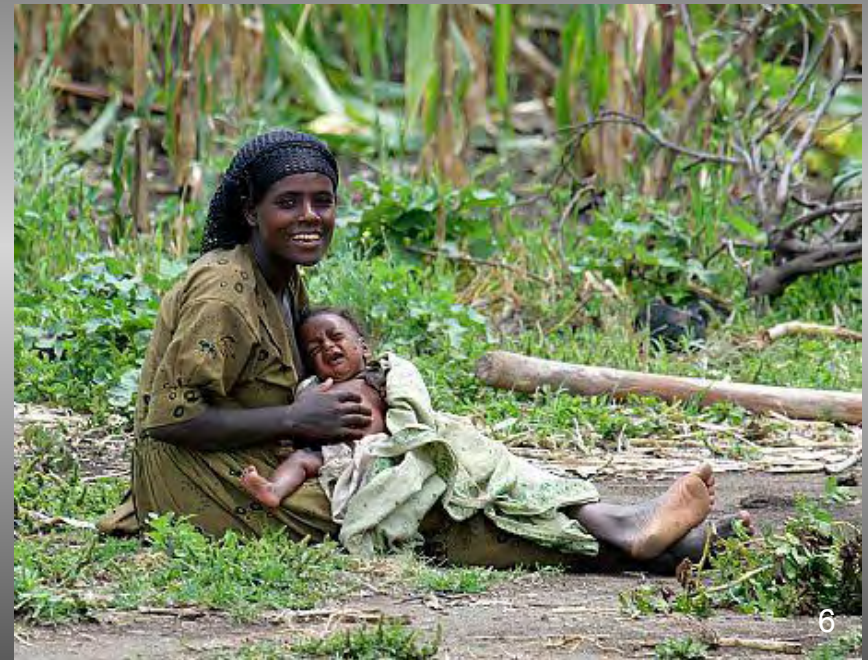
Unknown woman - poor but smiling: this is what we, Europeans should learn,