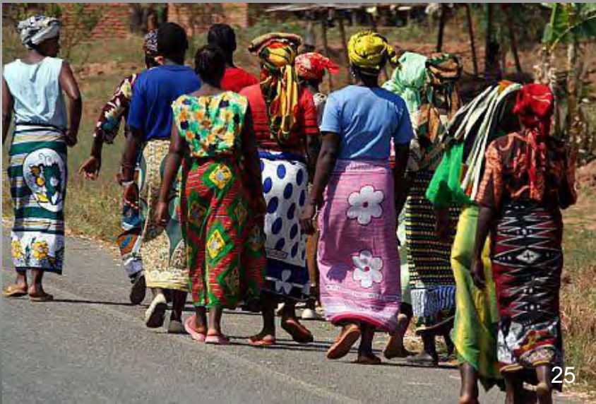
Women walking dressed in their typical piece of colorful cloth