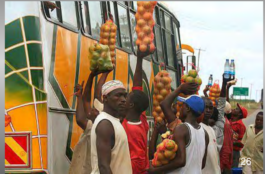
Typical way of selling