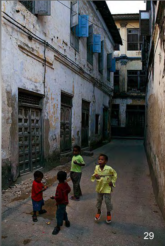
Kids in Stone Town, a town protected by UNESCO