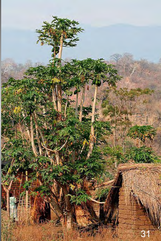
Papaya is grown everywhere