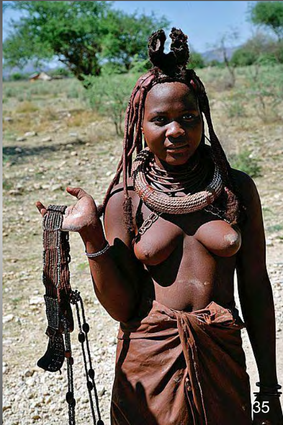
Himba girl, a tribe living in the north