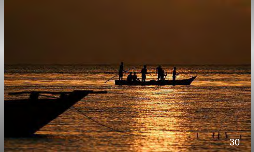
Fishermen in the morning sunrise