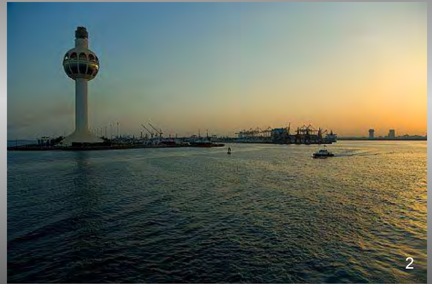
Jeddah, big harbor in Saudi Arabia from which we cross to Sudan