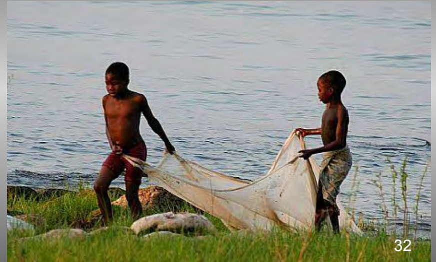
Malawi is made of Malawi lake where people find their way of living. Boys must learn how to fish from the childhood.