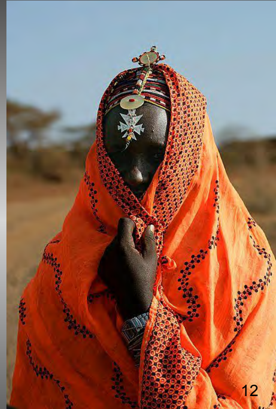
The desert has no end