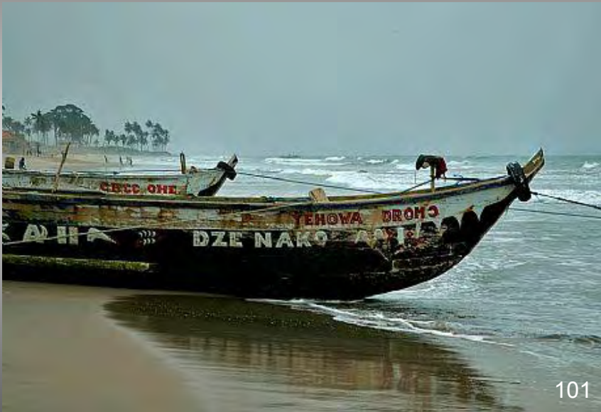
Boats used for fishing are painted