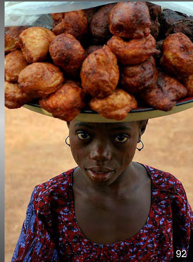
A girl selling sweets. They are everywhere. It is difficult to refuse them.