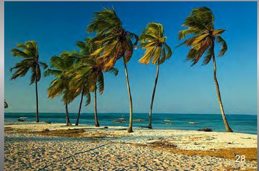
Zanzibar is famous for its beaches