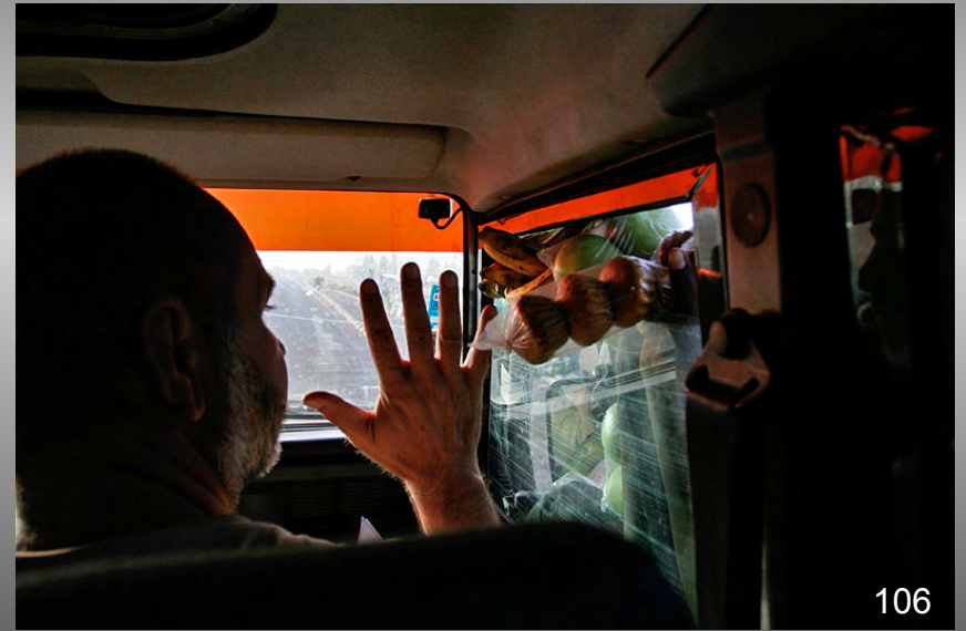
the way of selling is sometimes very rude