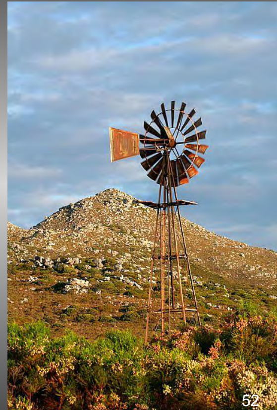
Typical view - water pump