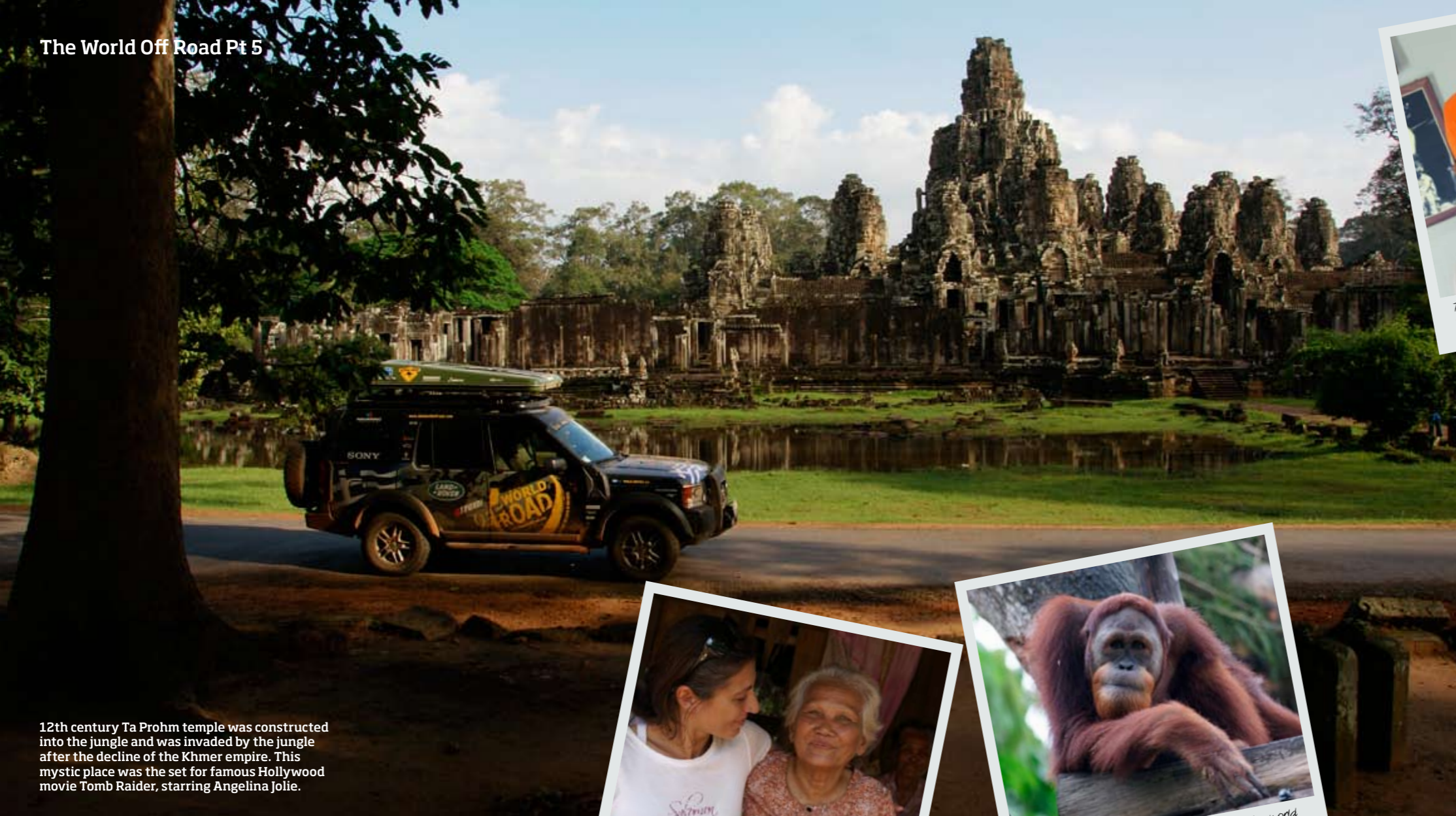
12th century Ta Prohm temple was constructed into the jungle and was invaded by the jungle after the decline of the Khmer empire. This mystic place was the set for famous Hollywood movie Tomb Raider, starring Angelina Jolie.