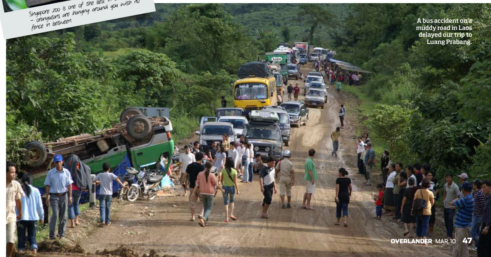
A bus accident on a muddy road in Laos delayed our trip to Luang Prabang.