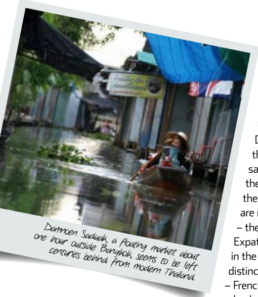
Damnoen Saduak, a floating market about one hour outside Bangkok, seems to be left centuries behind from modern Thailand.