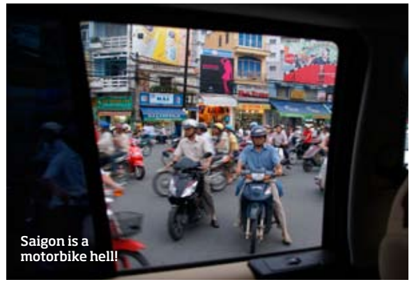
Saigon is a motorbike hell!

Northern Thailand is much more developed than Laos but is laid back as well. This country is incredibly organized. Wherever we traveled, roads were perfectly paved, towns well signed and lively from dawn until late at night. Don't