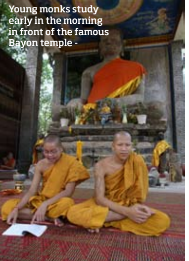
Young monks study early in the morning in front of the famous Bayon temple -