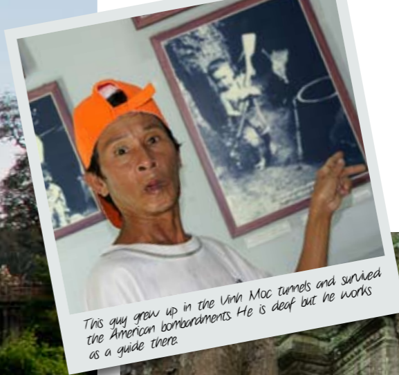
This guy grew up in the Vinh Moc tunnels and survived the American bombardments. He is deaf but he works as a guide there.