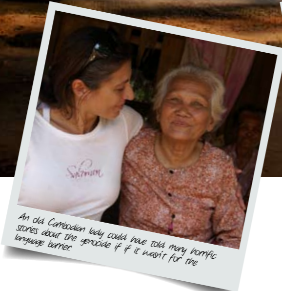
An old Cambodian lady could have told many horrific stories about the genocide if it wasn't for the language barrier.

“ kehgrire iurg8egfewiru yewfer8gyug uyvg uygdw8 gv dygwudyg wduyg7wd fydg ”