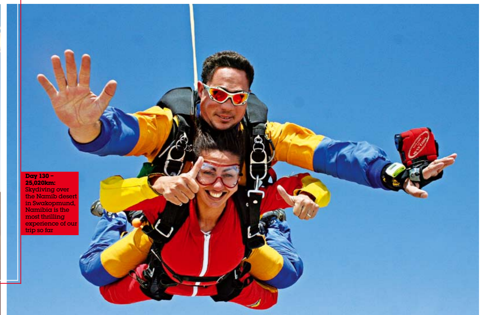
Day 130 - 25,020km: Skydiving over the Namib desert in Swakopmund, Namibia is the most thrilling experience of our trip so far