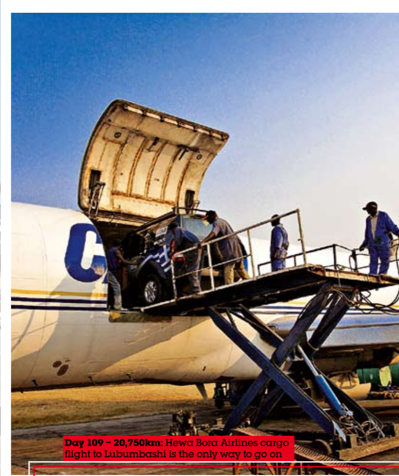
Day 109 - 20,750km: Hewa Bora Airlines cargo flight to Lubumbashi is the only way to go on