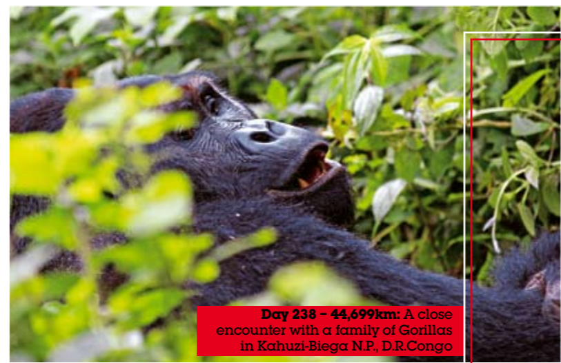
Day 238 - 44,699km: A close encounter with a family of Gorillas in Kahuzi-Biega N.P., D.R.Congo