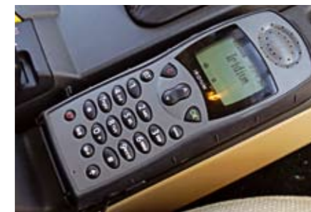
Motorola 9505A Iridium phone. Charges are a dollar per minute to landline phones