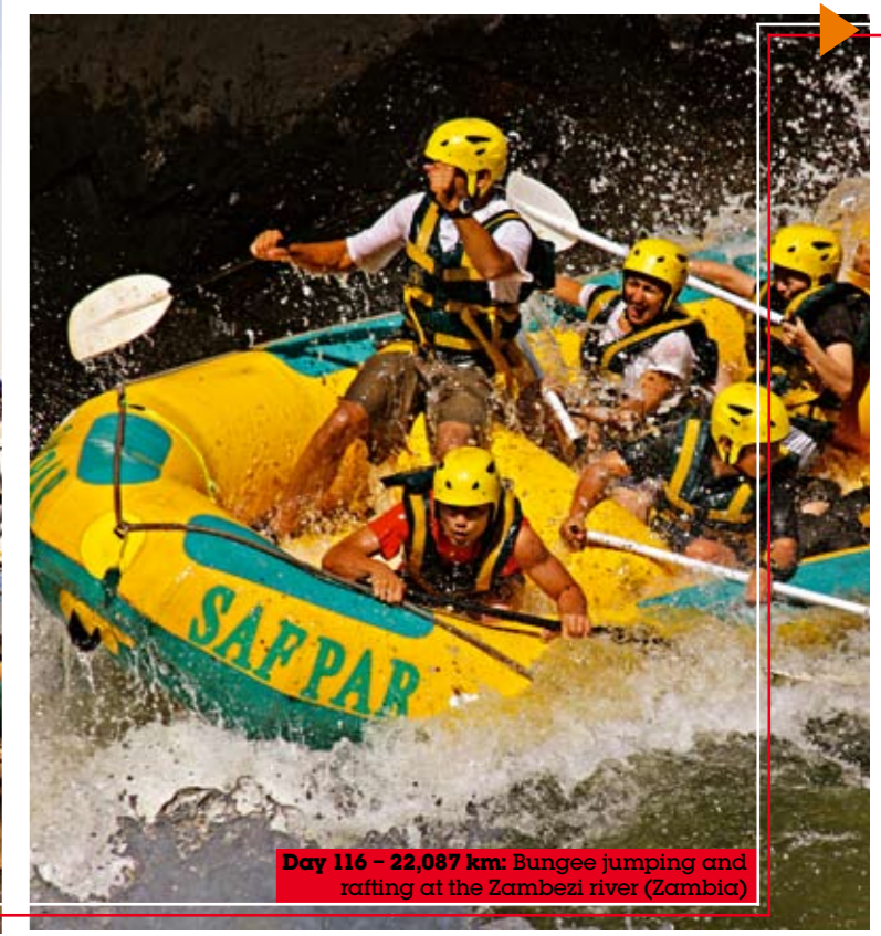
Day 116 - 22,087 km: Bungee jumping and rafting at the Zambezi river (Zambia)