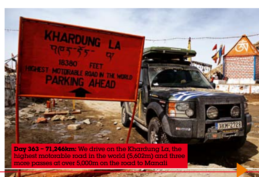
Day 363 - 71,246km: We drive on the Khardung La, the highest motorable road in the world (5,602m) and three more passes at over 5,000m on the road to Manali