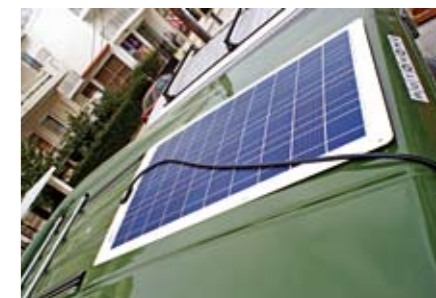
75W solar panel by Conergy provides 220V electricity through an auxiliary 45A dry type battery and a 500W inverter