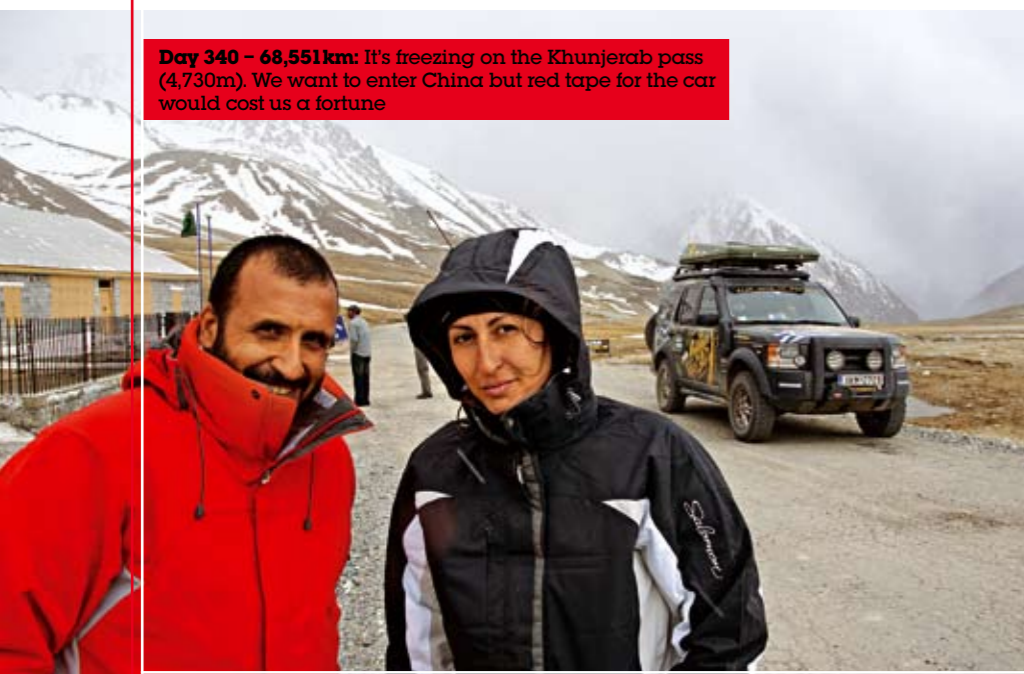
Day 340 - 68,551km: It's freezing on the Khunjerab pass (4,730m). We want to enter China but red tape for the car would cost us a fortune