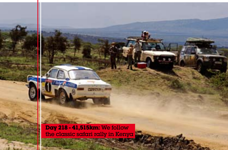
Day 218 - 41,515km: We follow the classic safari rally in Kenya