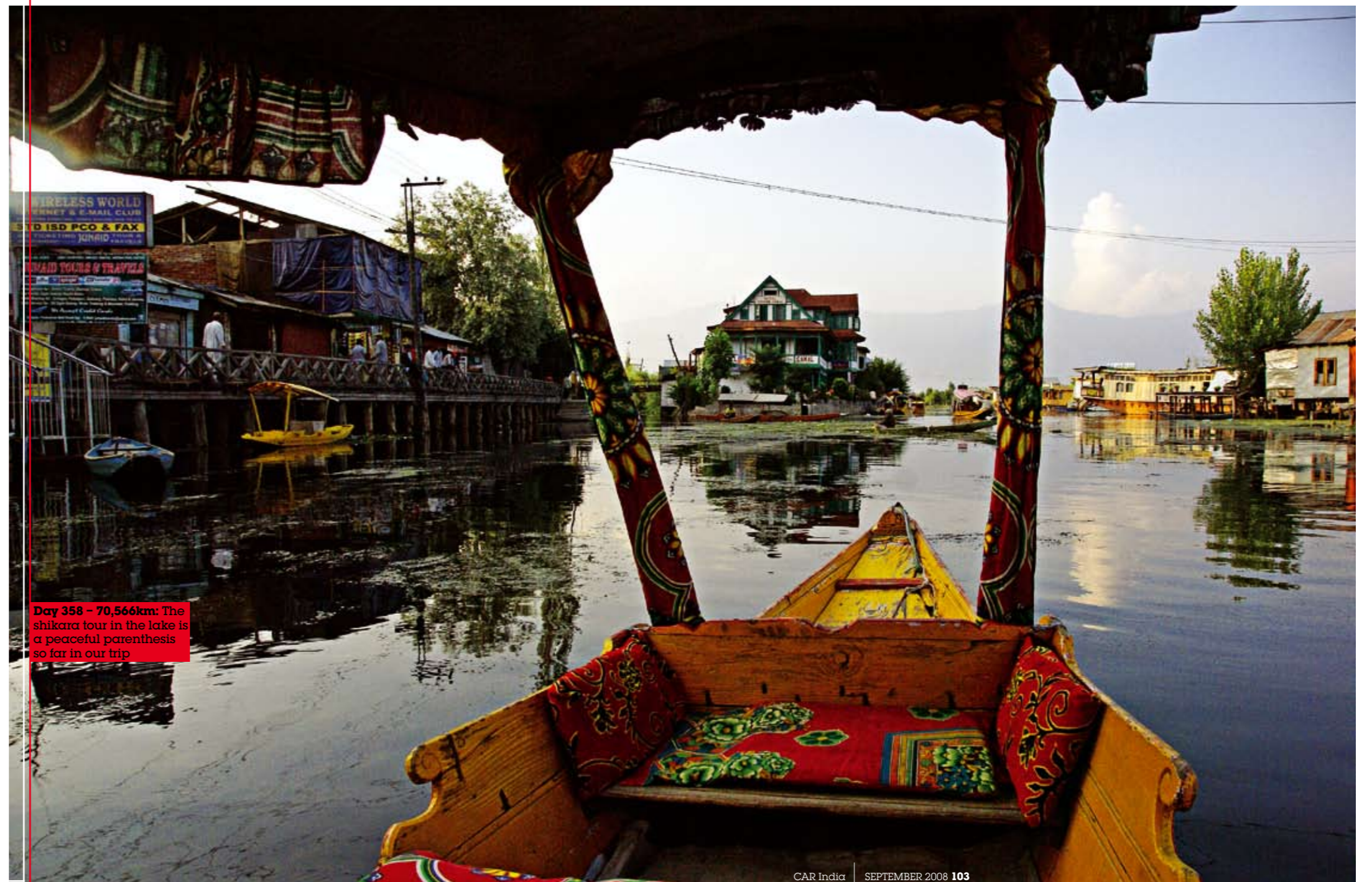
Day 358 - 70,566km: The shikara tour in the lake is a peaceful parenthesis so far in our trip