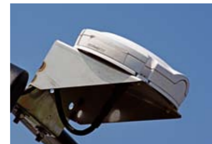
Position reporter. It automatically transmits the real position of the car to a satellite so you can see where we are on the web