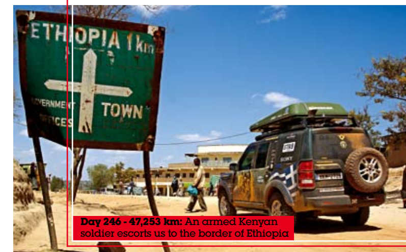
Day 246 - 47,253 km: An armed Kenyan soldier escorts us to the border of Ethiopia