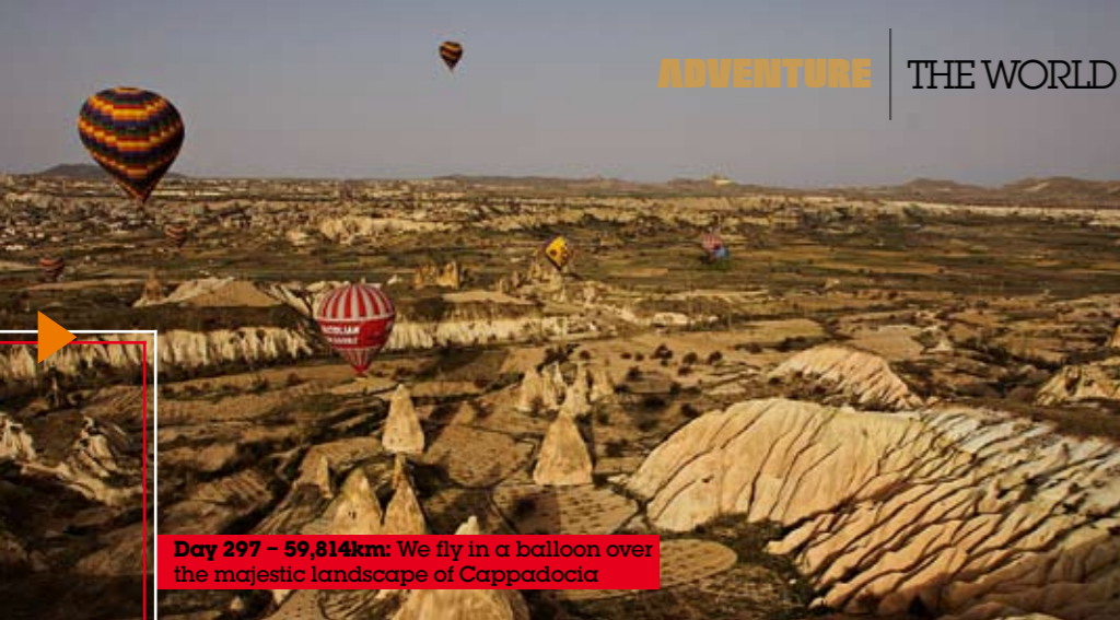
Day 297 - 59,814km: We fly in a balloon over the majestic landscape of Cappadocia