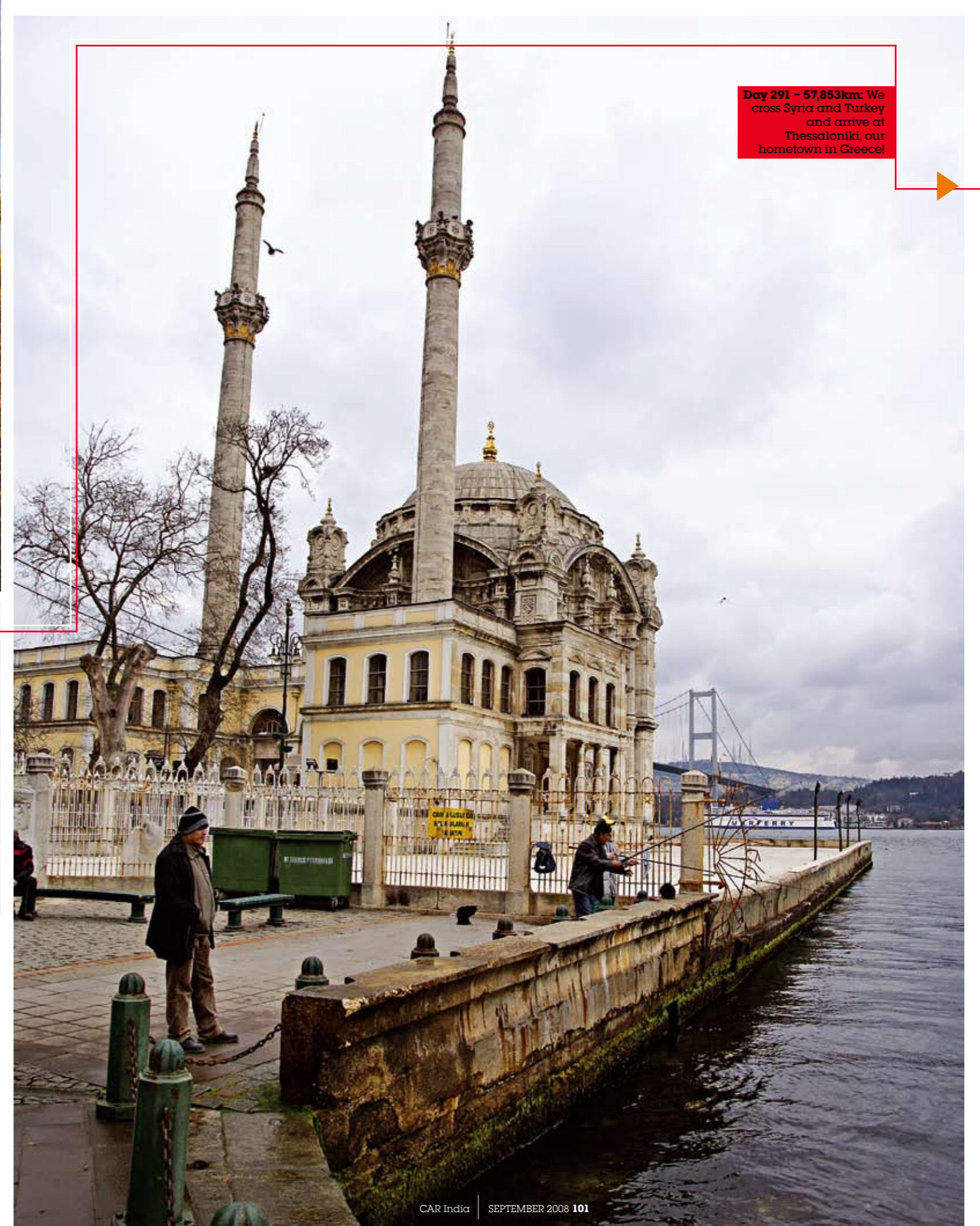
Day 291 - 57,853km: We cross Syria and Turkey and arrive at Thessaloniki, our hometown in Greece!