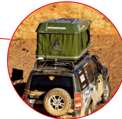
Italian made Autohome Maggolina roof tent is the shelter of the crew