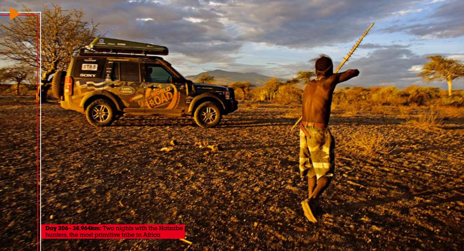
Day 206 - 38,964km: Two nights with the Hatzabe hunters, the most primitive tribe in Africa