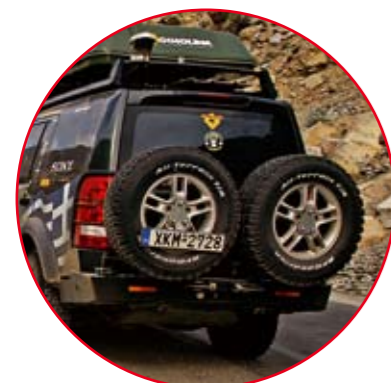
Double spare wheel base by Kaymar