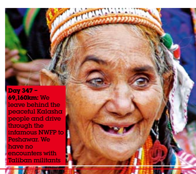
Day 347 - 69,160km: We leave behind the peaceful Kalasha people and drive through the infamous NWFP to Peshawar. We have no encounters with Taliban militants