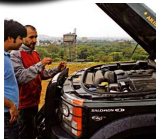
Engine CPU is tuned by Overfinch for better torque at low revs. It is combined with a TGI air filter. Car interior: Rear seats were deducted. Two customized safe boxes and a 55-litre water tank are fitted.