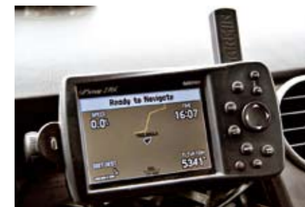
Garmin 276C GPS