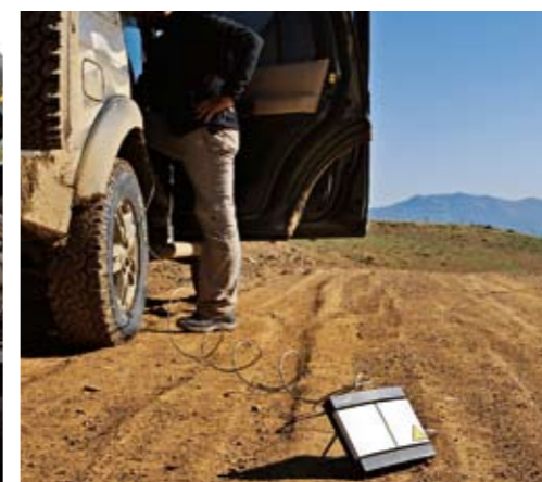
Thrane Explorer 300 Inmarsat satellite antenna provides broadband (492kbps) internet connection anywhere on earth (98 percent coverage). It is provided by Navarino Telecom-Greece