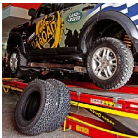
Tyres used: Cooper Discoverer STT (245/70-17) in Africa and BF Goodrich 245/75-17 in Asia.