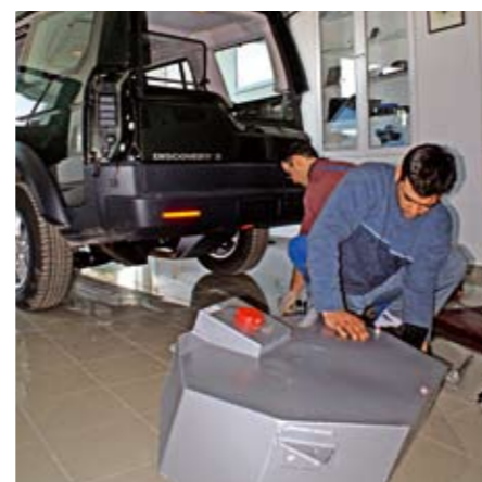
Outback Import (www.outback-import.com) auxiliary 110-litre fuel tank fitted at the spare wheel compartment