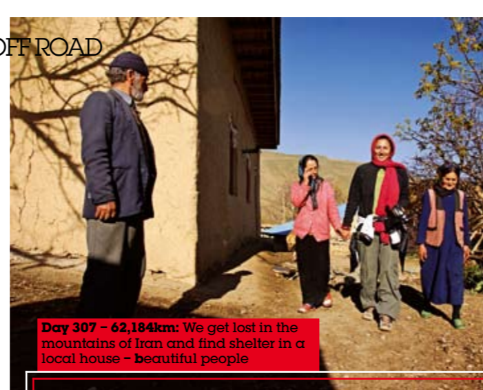
Day 307 - 62,184km: We get lost in the mountains of Iran and find shelter in a local house - beautiful people