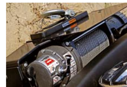
9.500 lb. Warn winch