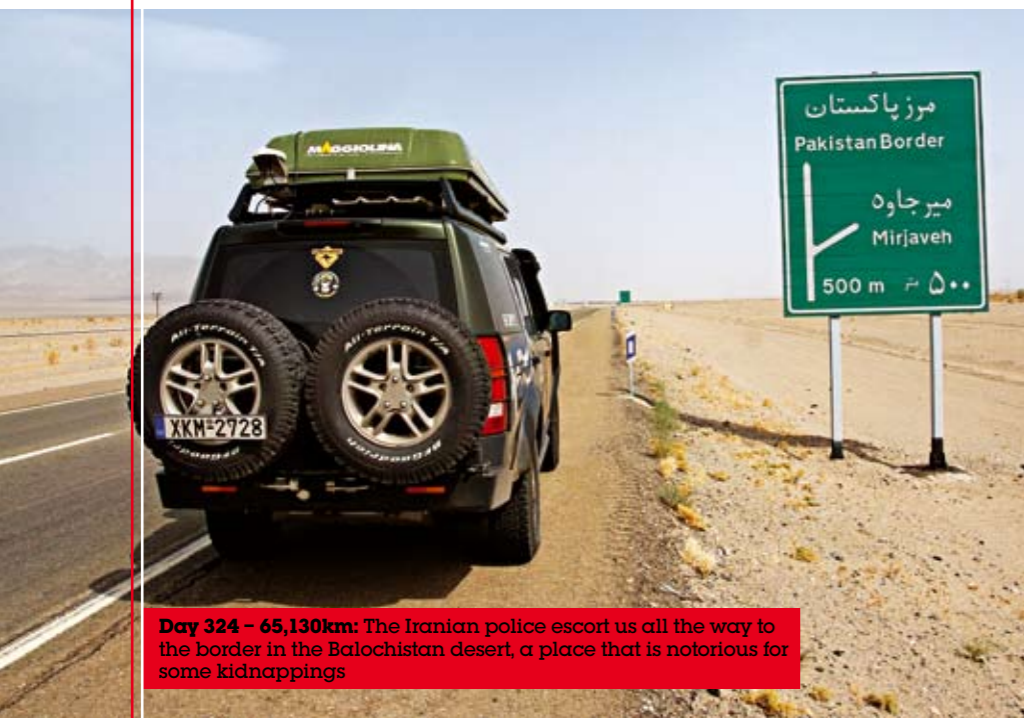
Day 324 - 65,130km: The Iranian police escort us all the way to the border in the Balochistan desert, a place that is notorious for some kidnappings