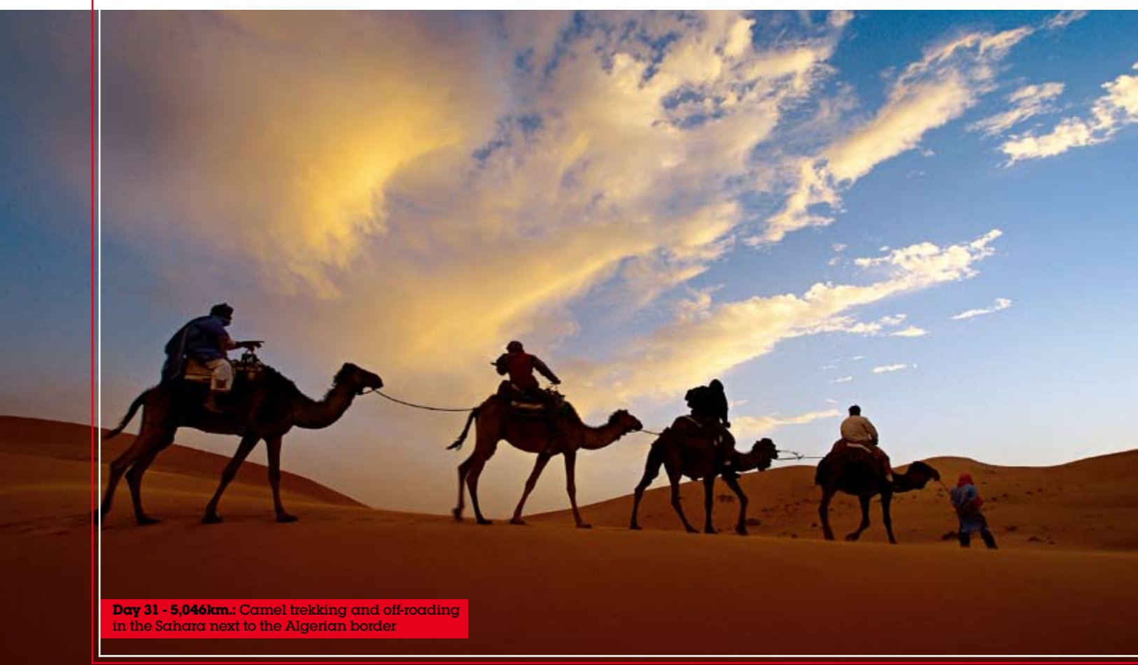
Day 31 - 5,046km.: Camel trekking and off-roading in the Sahara next to the Algerian border